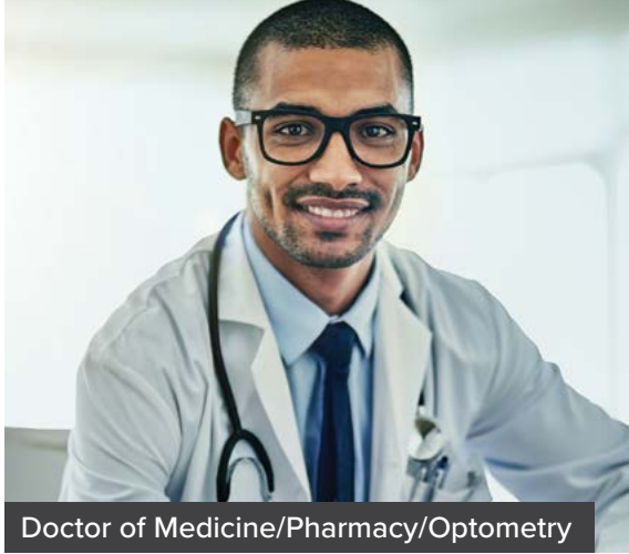
Doctor of Medicine/Pharmacy/Optomtry

You serve our community. Let us serve you by offering a loan designed for the unique needs of a professional. Let Carrollton Bank help manage your financial goals and strategies.